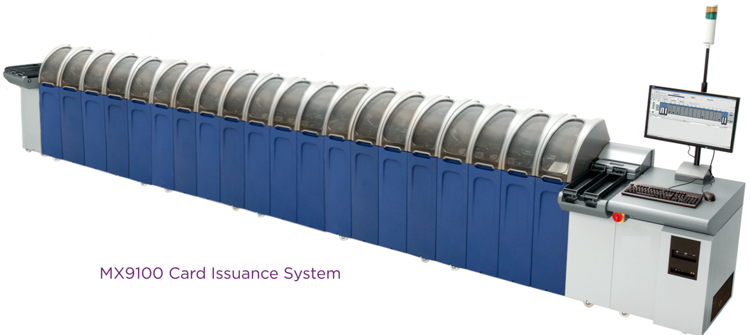
MX9100 Card Issuance System

Service and support: The MX Series Platform is supported by the industry's largest service and support network, which spans more than 150 countries worldwide. Online and phone support is available 24/7.